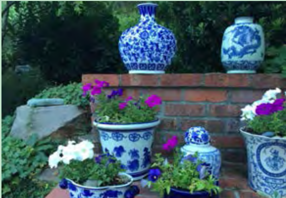
Charming arrangements of urns and pots with petunias and pansies.